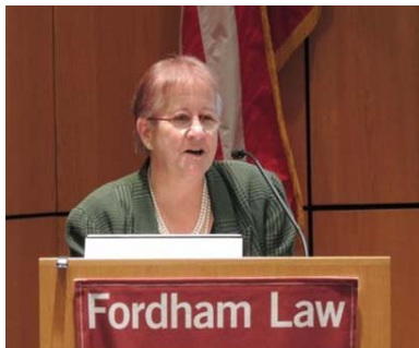
President Wedgwood Opens the Session

The ILW Organizing Committee put together an extraordinarily diverse program of more than 30 substantive panels on such topics as issues in international litigation, intellectual property, children in armed conflict, the crisis in Syria, international commercial and investment arbitration, big data and privacy, outer