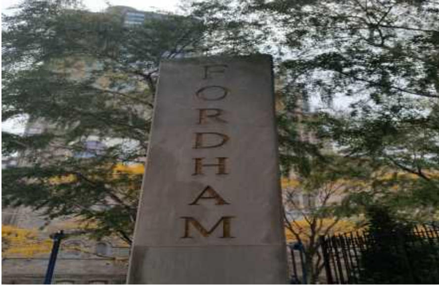
Fordham Law School