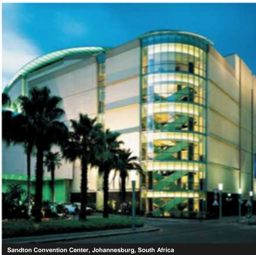
Sandton Convention Center, Johannesburg, South Africa

The next meeting of the Branch Board of Directors will take place on Friday, April 1, from 3:00-4:30 pm in the Glacier Room of the Hyatt Regency Hotel in Washington in conjunction with the Annual Meeting of the American Society of International Law. All members of the Board are expected to attend in person or by teleconference. Those who are unable to attend should communicate promptly with the Branch's Honorary Secretary. The agenda and associated reports have been circulated to Board members.