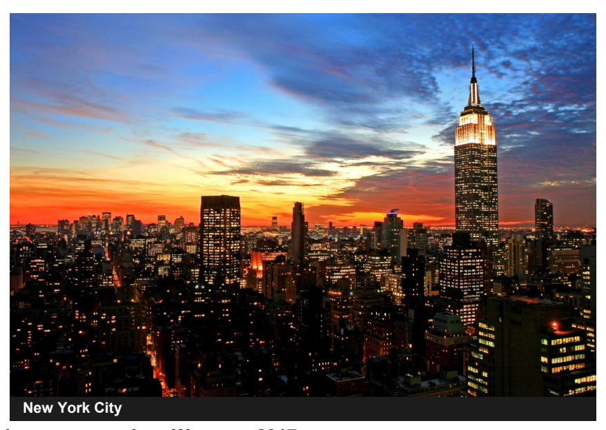
INTERNATIONAL LAW WEEKEND 2017 (CONTINUED FROM PAGE 1)

The rapidly changing global landscape will test the adaptability and dynamism of international law. Unprecedented health crises, massive refugee outflows, climate change, the use of chemical weapons, the persistence of gender inequality, and other global challenges require innovative solutions. The opportunity exists for international law to reestablish its strong connection with the global community it serves.