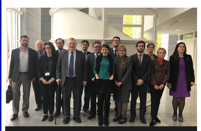
5th Meeting of ILA Committee on the Protection of Privacy in Private International and Procedural Law