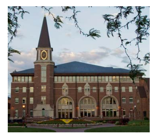
Univ. of Denver, Sturm College of Law

The University of Denver's Sturm College of Law will host a regional International Law Weekend on Friday, February 12, and Saturday, February 13, 2010. The theme of the Weekend is "Sustainable Development, Corporate Governance, and International Law." The conference organizers will provide information about skiing opportunities for those able to spend time in Colorado either before or after the conference.