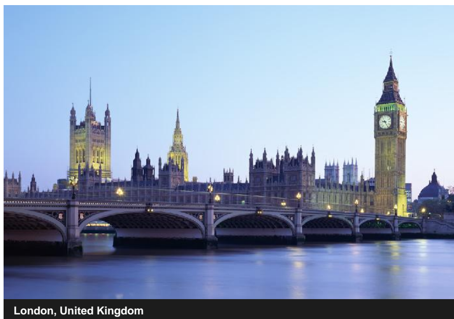
London, United Kingdom