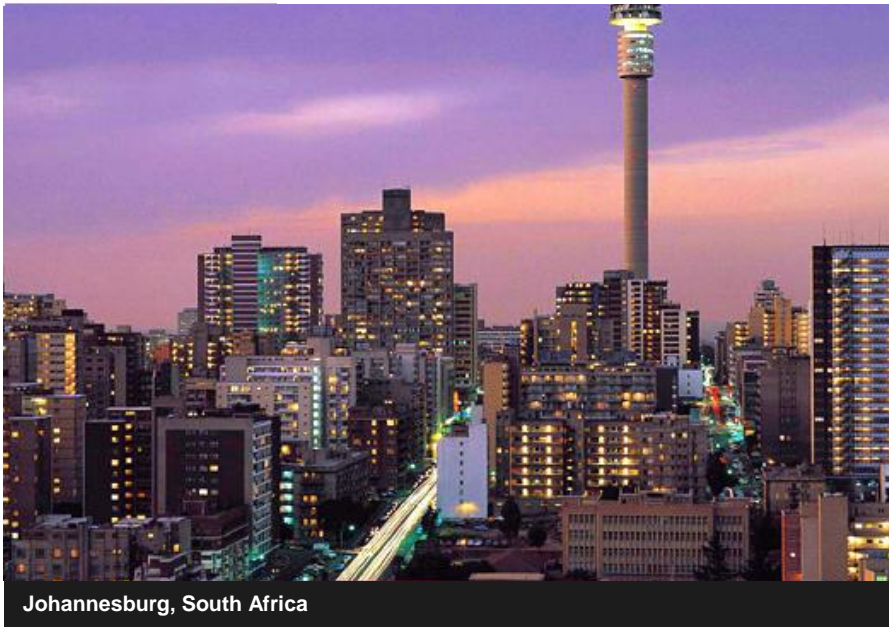
Johannesburg, South Africa