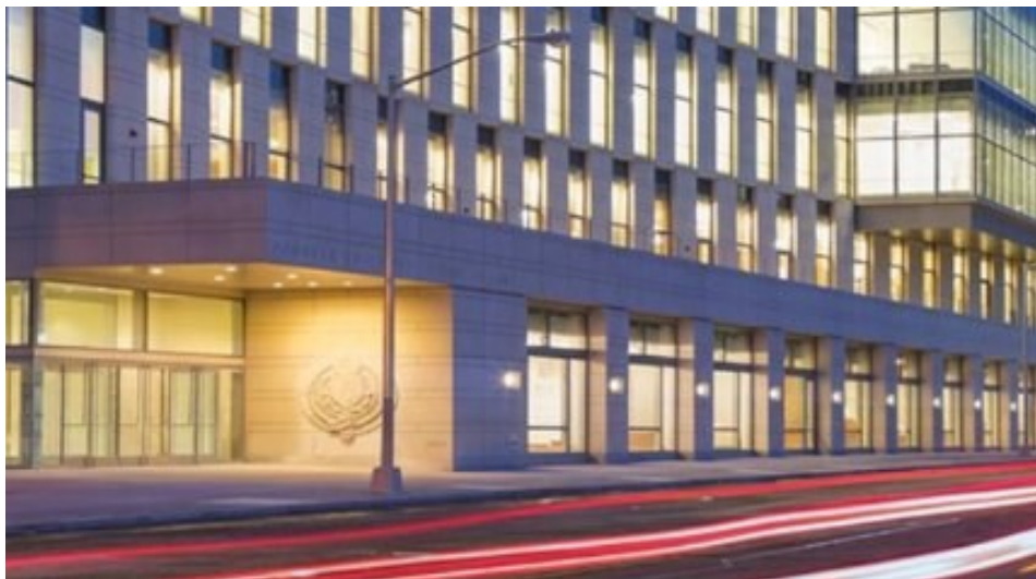
Fordham Law School

The next meeting of the Branch Board of Directors will also take place at ILW, at 12:30 pm on Saturday afternoon also in Room 2-02A, immediately before the annual membership meeting. A box lunch will be provided, as usual.