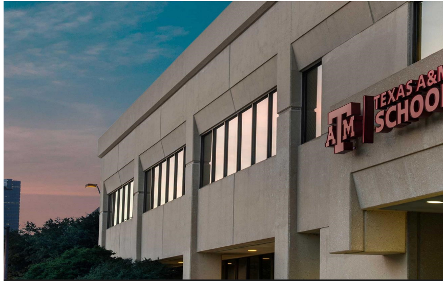
Texas A&M University School of Law