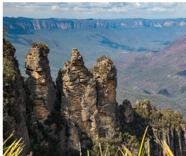
The Blue Mountains, New South Wales

American Bar Association - Section of International Law, American Society of International Law, Arizona State University Sandra Day O'Connor College of Law, Brill USA, Inc., California Western School of Law, Case Western Reserve University School of Law, Columbia Law School, Dean Rusk International Law Center University of Georgia School of Law, Debevoise & Plimpton LLP, Foley Hoag LLP, Fordham University School of Law, George Washington University Law School, Georgetown University Law Center International and Non-J.D. Programs, Fordham University School of Law Leitner Center for International Law & Justice, New York University School of Law, New York University School of Professional Studies Center for Global Affairs, Oxford University Press, Princeton University James Madison Program in American Ideals and Institutions, Princeton University Program in Law and Public Affairs, The Fletcher School Tufts University, University of Georgia School of Law, University of Nebraska, University of Pennsylvania Law School, University of Pittsburgh School of Law, Washington and Lee Law School Transnational Law Institute, White & Case LLP, Whitney R. Harris World Law Institute, Washington University School of Law.