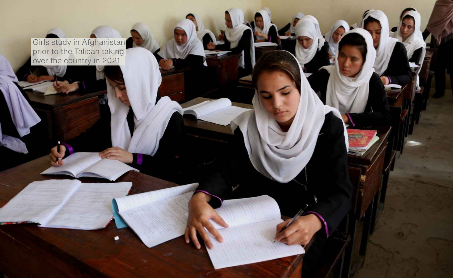
Girls study in Afghanistan prior to the Taliban taking over the country in 2021.