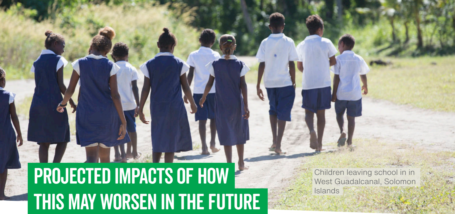
Children leaving school in West Guadalcanal, Solomon Islands