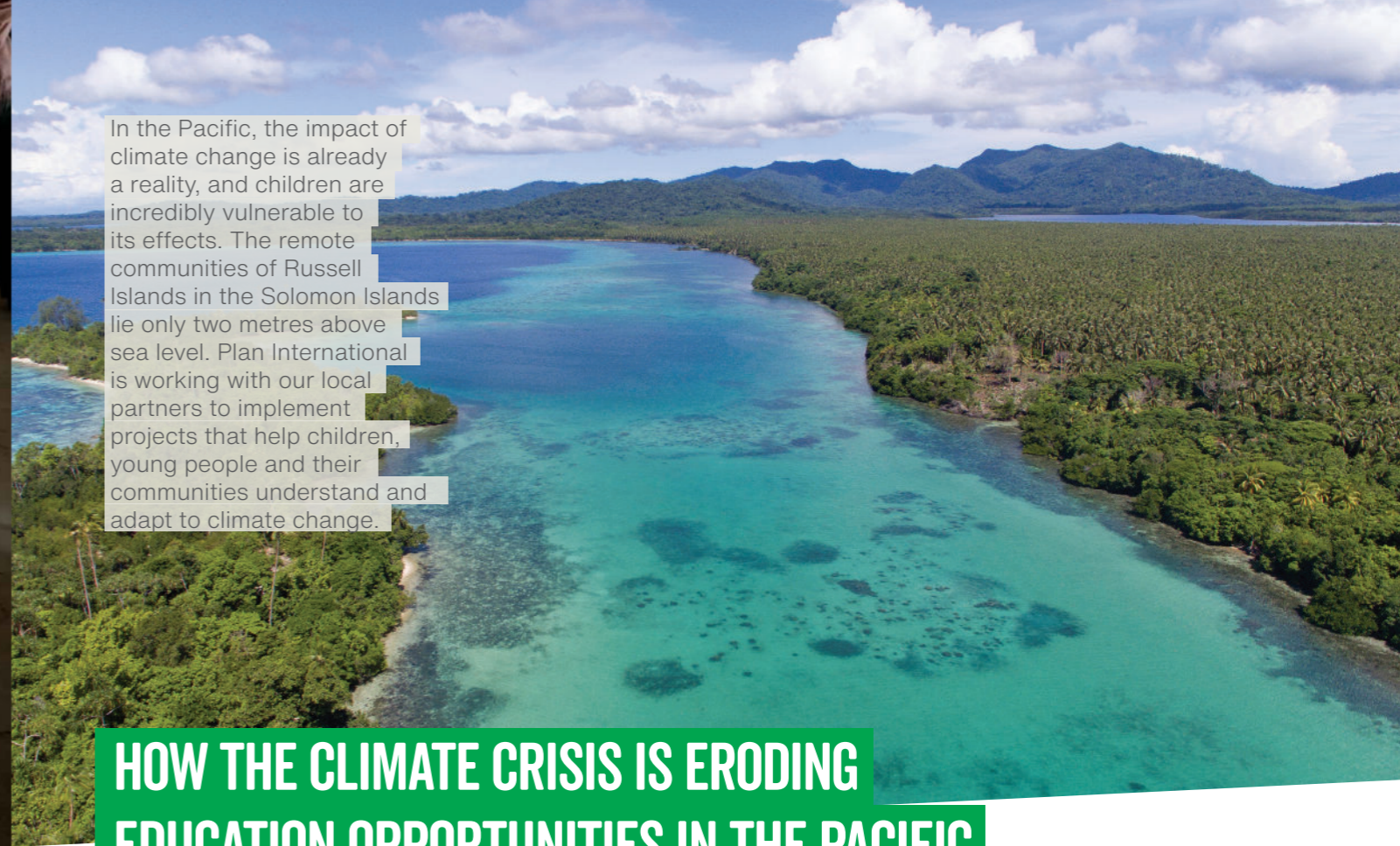
In the Pacific, the impact of climate change is already a reality, and children are incredibly vulnerable to its effects. The remote communities of Russell Islands in the Solomon Islands lie only two metres above sea level. Plan International is working with our local partners to implement projects that help children, young people and their communities understand and adapt to climate change.