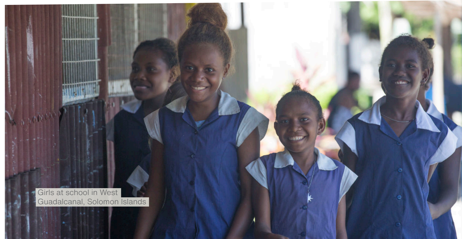
Girls at school in West Guadalcanal, Solomon Islands