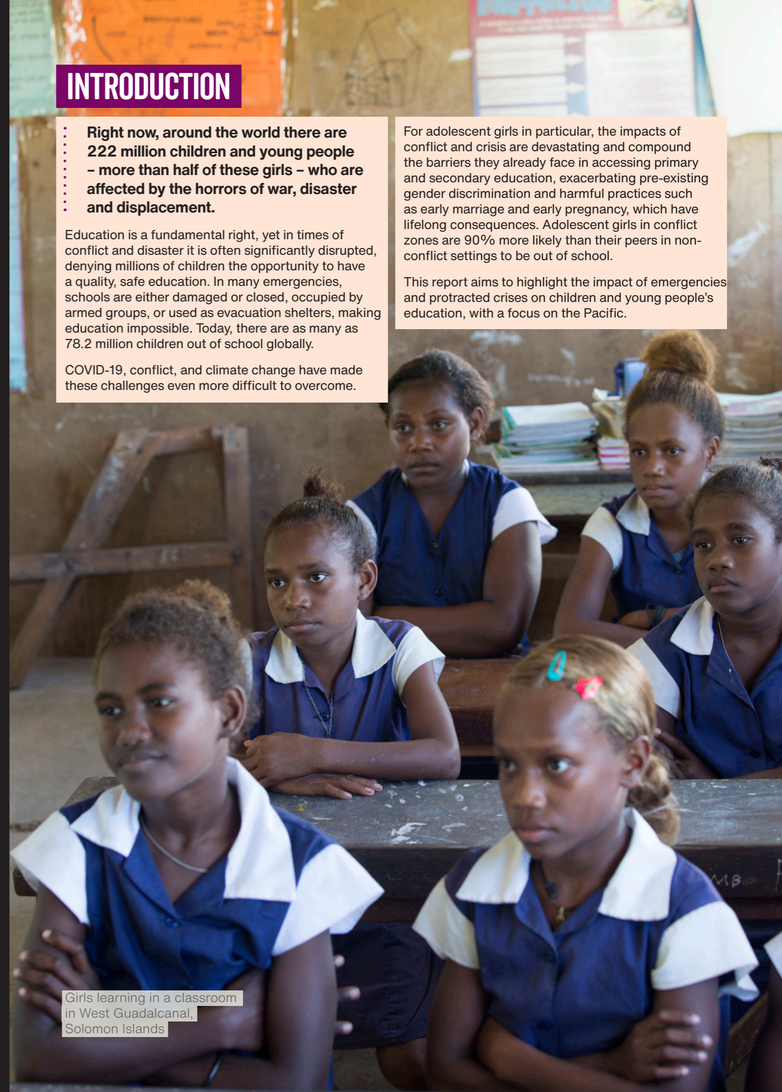
Girls learning in a classroom in West Guadalcanal, Solomon Islands

This report aims to highlight the impact of emergencies and protracted crises on children and young people's education, with a focus on the Pacific.