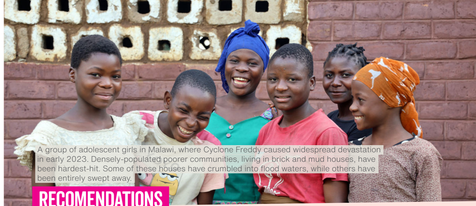
A group of adolescent girls in Malawi, where Cyclone Freddy caused widespread devastation in early 2023. Densely-populated poorer communities, living in brick and mud houses, have been hardest-hit. Some of these houses have crumbled into flood waters, while others have been entirely swept away.